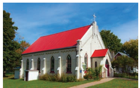
SACRED HEART - WARMINSTER