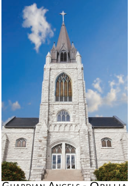
GUARDIAN ANGELS - ORILLIA