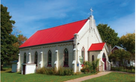
SACRED HEART - WARMINSTER

<u>Guardian Angels</u> Weekdays 12:10pm Saturday 9am Saturday Vigil 5pm Sunday 9 & 11am