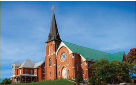
ST. COLUMBKILLE - UPTERGROVE

<u>St. Francis</u> Sunday 9:30am <u>St. Columbkille</u> Saturday Vigil 7pm Sunday 11am