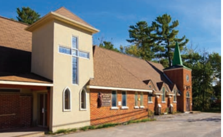
ST. FRANCIS - WASHAGO