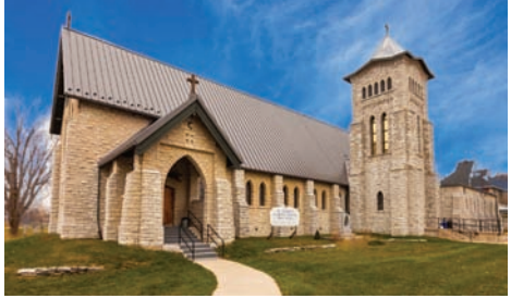
ST. ANDREW'S - BRECHIN