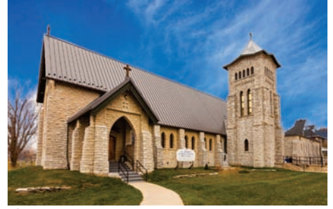
St. Andrew's - Brechin