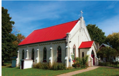
SACRED HEART - WARMINSTER