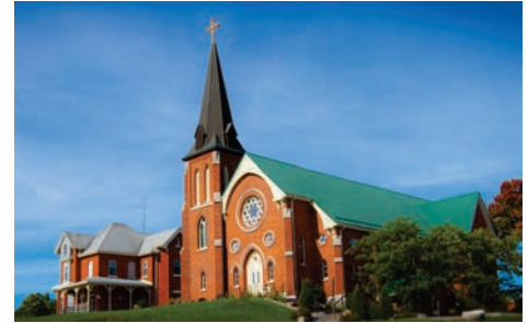
ST. COLUMBKILLE - UPTERGROVE