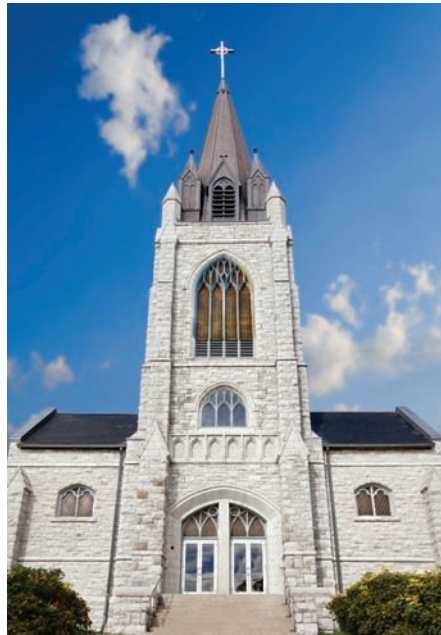
GUARDIAN ANGELS - ORILLIA