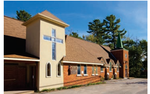
ST. FRANCIS - WASHAGO