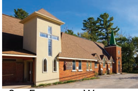
St. Francis - Washago