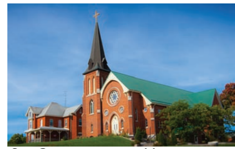
St. Columbkille - Uptergrove